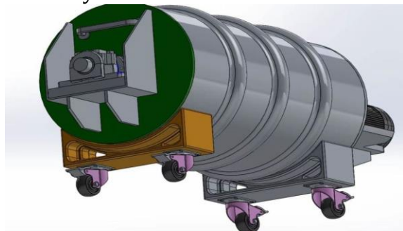
Figure 1: Finished product of appearance design (self-made)

(1) Universal wheel [6] and motor [7] are downloaded standard parts, which are assembled with import and assembly commands.