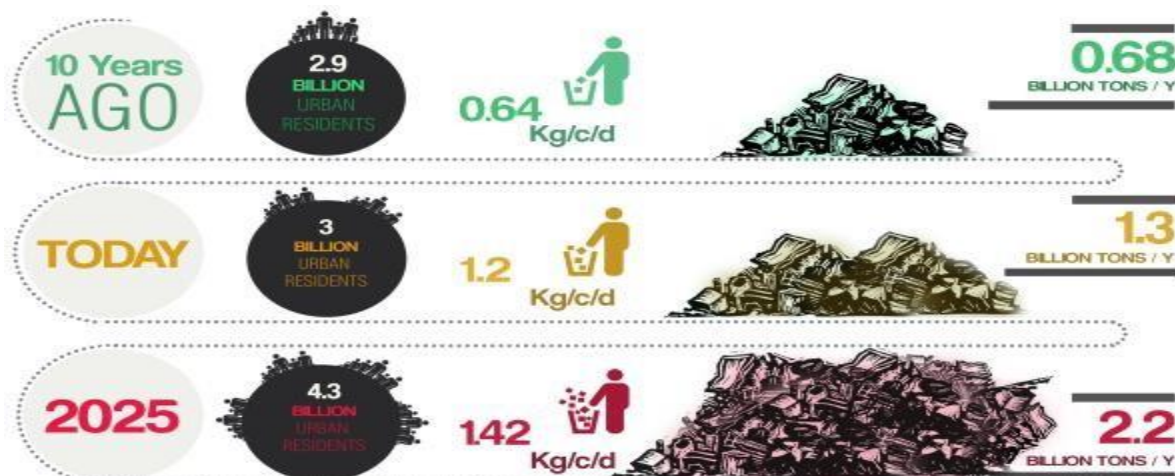
Figure 1: Municipal Solid Waste Quantities (Hoornweg and Bhada-Tata, 2012)

The total amount of MSW generated globally is estimated at about 1,300 million tonnes per area, and it is expected to increase to approximately 2,200 million tonnes by 2025 as shown in Figure 1 (Hoornweg and Bhada-Tata, 2012). The major sources of MSW are the residential and commercial sectors (Figure 2; Mihelcic and Zimmerman, 2010). The quantities of food wastes, garden wastes, paper, plastic and glass generated from both sectors contribute most to solid waste over all. Then the waste quantities vary among the remaining sectors, with construction and demolition having the highest contribution percentage after the residential and commercial sectors. This is due to the generation of concrete, metal, wood, asphalt, wallboard and dirt-predominant wastes.