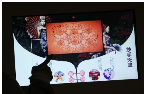
Figure 9. Static display of clothing (real objects) Figure 10. Clothing dynamic display (virtual)

In the field of exhibition design, scenographic display is a narrative approach to presenting exhibits to the audience. It constructs a story about the exhibits and uses narrative methods to interpret the life context of the exhibits and present the interactive relationship between "people-exhibits" to the audience. A good story can not only carry information about the exhibits and evoke the audience's emotions in the visual, dynamic, and spatial aspects but also play a role in telling the story of the interaction between the audience and the exhibits.