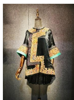
Figure 1. Flat platform displays Figure 2. Hanging displays Figure 3. Three-dimensional supported by stands displays with mannequins