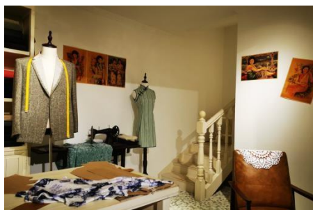
Figure 7. Physical Scene Display