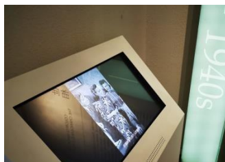
Figure 5. Dynamic videos in situational display