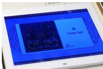
Figure 4. Static images in flat display