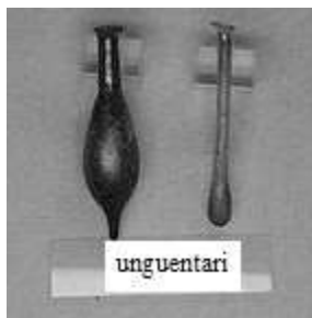
Figure 3: Roman perfume bottles (unguentari) on display at Villa Boscoreale . Adapted from 19

Giuseppe Squillace has translated the “De odoribus” by Theophrastus where he mentioned his knowledge about the perfumes and scents around the Mediterranean world; from Lydia to Athens, Egypt and Syria.