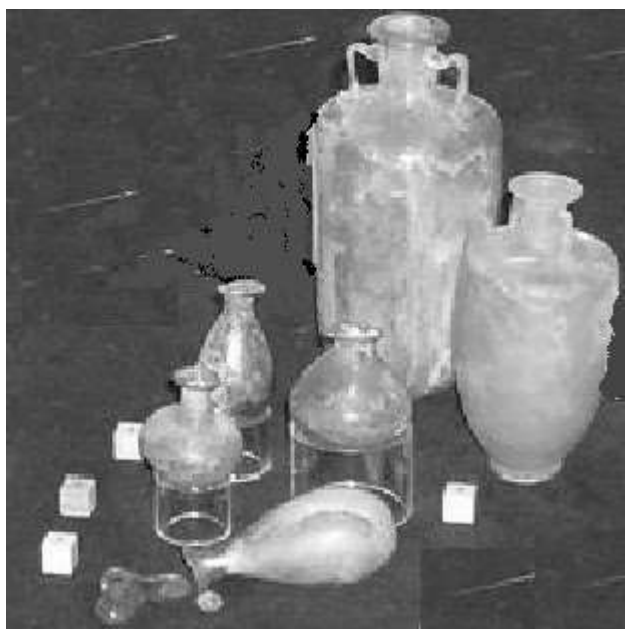
Figure 2: Ancient roman utensils to cosmetics' preparation. Adapted from 18

Thickening perfumes and ointments was achieved by heating the oil and spice in a water tank, adding resin and gum. Aromatic wines, water and honey also played an important role in the final composition of perfumes and ointments. Lanolin was used only from Pliny's time onwards, mixed with honey as an ointment to remove stains from the face. There are numerous recipes and depictions of the perfume preparation in numerous ancient temples all over the known world. 9 Aroma use was spread from Greece, to Rome (Fig.2, Fig.3) and later to the Islamic world.