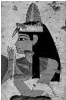
Figure 1: Perfume cones. Adapted from

Dollinger referring to Lichtheim in his work informs us that the Egyptians, during New Kingdom, carried little cones in their hair, which had been made of solid perfume and scented for a long period (Fig. 1). 7,9