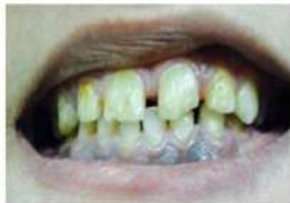
Figure 5: Intra oral photograph showing disto-incisal angle fracture of tooth #21