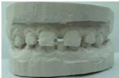
Figure 3 : Photograph showing cast of the patient

As part of treatment to prevent further complications, a night guard was provided for the patient to relief the pain and reduce the inflammation and tenderness in the TMJ area (figures 3, 4).