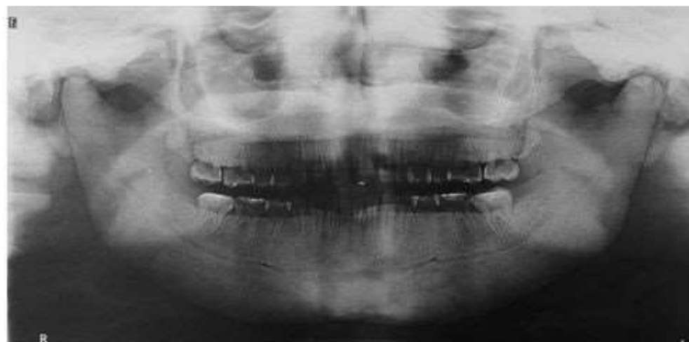
Figure 7: 3 months follow up panoramic radiograph

The patient was instructed to continue using the night guard on a daily basis to improve the muscular spasm and strain falling upon the TMJ and in turn to relieve the TMJ pain. And additionally, to improve her oral hygiene by regular brushing of her teeth twice a day and the use of mouth washes as she developed a new habit of smoking to relieve her stress. A recent panoramic radiograph was taken for follow up as shown in figure 7.