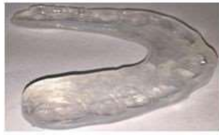
Figure 4 : Photograph showing constructed night guard

After 3 months, the patient was recalled to the dental clinic for follow up. On clinical examination, the pain in the TMJ area was relieved following the regular use of the night guard by the patient, but there was some increase in the density of the bone size in the lower molar area. Additionally, the patient came with fractured disto-incisal angle of the upper left central incisor [tooth #21] (Figure 5).