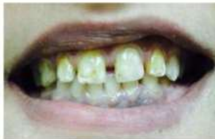
Figure 6: Intra oral photograph showing restoration of tooth #21