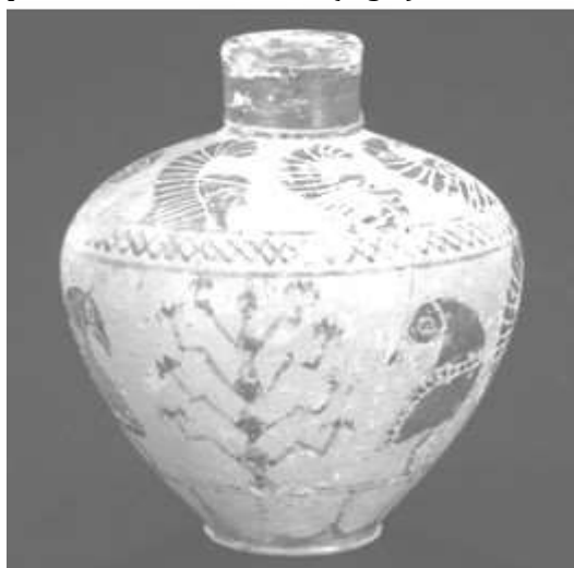
Figure 5: Proto-Corinthian aryballos, Royal Museums of Art and History, Brussels, inv. A2 Adapted from 14

Most perfume containers share some characteristics: narrow neck and opening, wide flat-rimmed or funnel shaped mouth. The most are quite small. According to Verbanck-Piérard's and Massar's reference to Rasmussen the chosen decorative images on perfume vases referred to the exotic origin of their contents. The oriental sign decoration of proto-Corinthian vases (Fig.5) could inform about the real or supposed Near-Eastern origin of their contents.