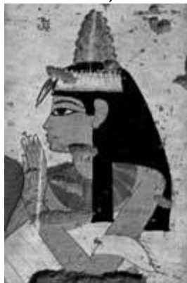
Figure 1: Perfume cones. Adapted from

Dollinger referring to Lichtheim in his work informs us that the Egyptians, during New Kingdom, carried little cones in their hair, which had been made of solid perfume and scented for a long period (Fig. 1). 7,9