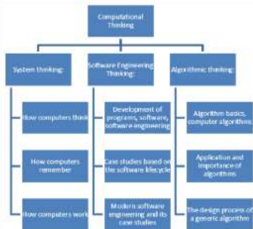
Figure 2: The core chapter of the Computational Mind Construction course in the discipline of computing.

The abstract forms in a discipline contain concrete content, which are the scientific concepts, symbols, and thought models possessed by the discipline. Taking the course Introduction to Computer Science and Programming as an example, the core chapters of this course are constructed as Figure 2.